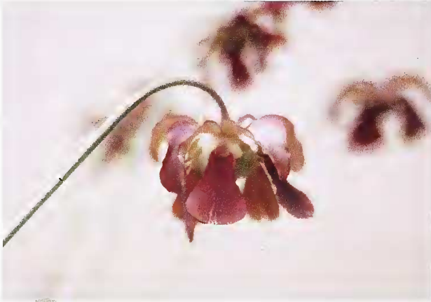
Figure 3. S. rubra ssp. gulfensis F 1 heterozygote. Red petals are deposited at FTG, #1469.